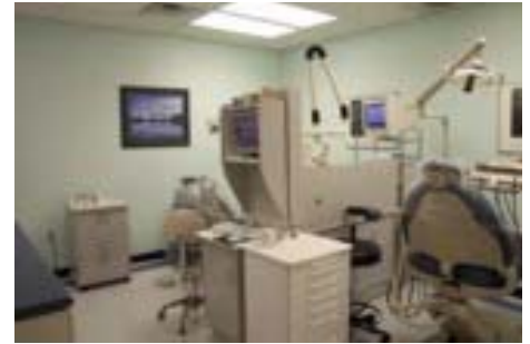
When getting a dental procedure done you can relax in either of these main dental procedure rooms.

*Once the dental visit is over, praise yourself for a job well done, and treat yourself to a special reward.